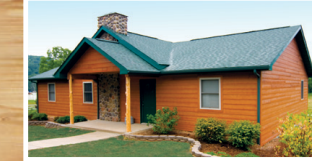
▲ Lodging Houses