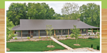
▲ Stephan's Riverside Event Center