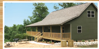
▲ Ridgeview Lodging