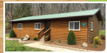
▲ Hideaway House