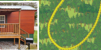
▲ Cozy Deluxe Cabins