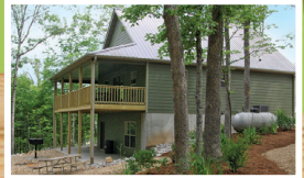
▲ Hickory Hollow Lodge