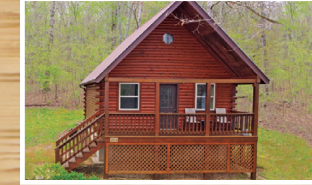
▲ Log Cabins