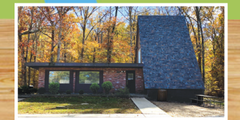
▲ A-Frame House