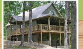
▲ Cedar Creek Lodge