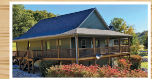
▲ Meadow View Lodging