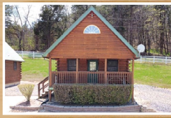
▲ Log Cabins