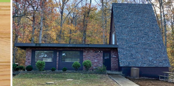
▲ A-Frame House