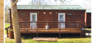
▲ Cozy Cabins