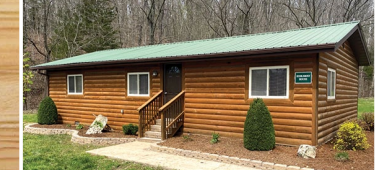
▲ Hideaway House