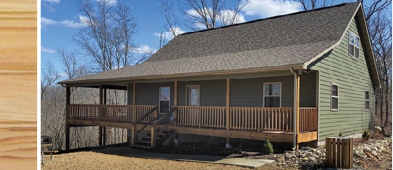
▲ Ridgeview Lodging