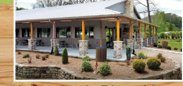
▲ Stephan's Riverside Event Center