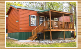
▲ Deluxe Cozy Cabins