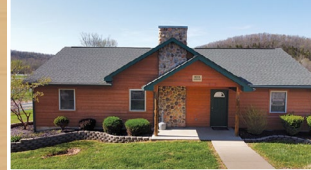
▲ Lodging Houses